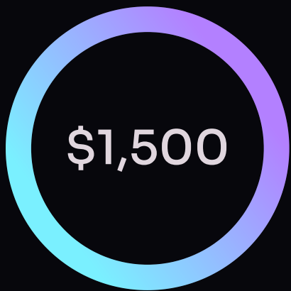
Avg. Lifetime Value

Even with just 3 new clients monthly, the impact is substantial.